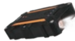
1 x UPP1000 Jump Start