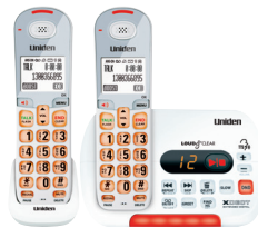
SS E35 + 1 Big Button Cordless, TTS, 2 Handsets