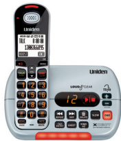
SS E35 Big Button Cordless, TTS