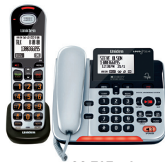
SS E37 + 1 Cordless + Coded 2 in 1 Phone, TTS