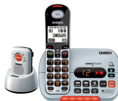
SS E35 + Pendant Big Button Cordless, TTS, 1 SOS Pendant