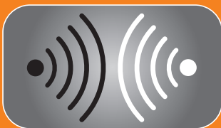
Full-Duplex Conversation, and Crystal-Clear Voice