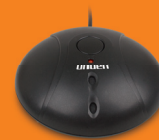
VP MIC-30 Wired Satellite Microphone

Visit Uniden's authorised stockists or Uniden's ONLINE SHOP for Genuine Accessories