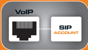
Compatible with 3 SIP* Accounts