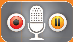
Conversation Record with Ability to Record Meetings