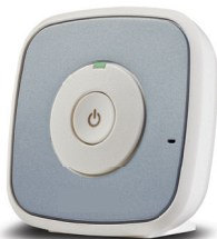
BW120 Baby Unit