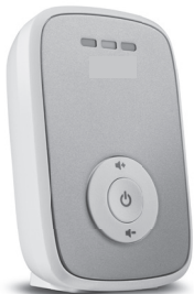
BW120 Parent Unit